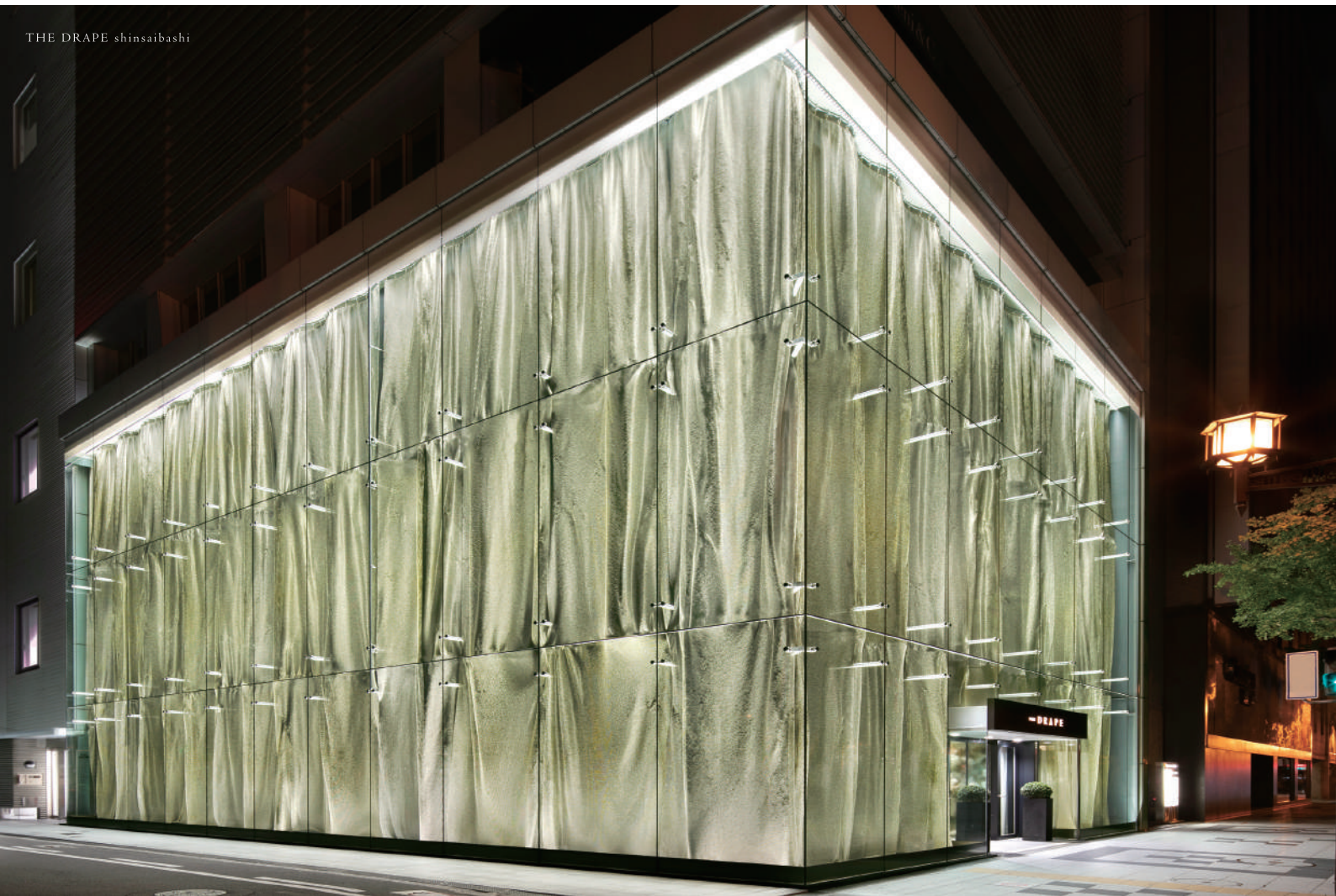
THE DRAPE shinsaibashi